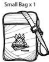
Small Bag x 1