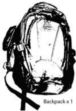
Backpack x 1