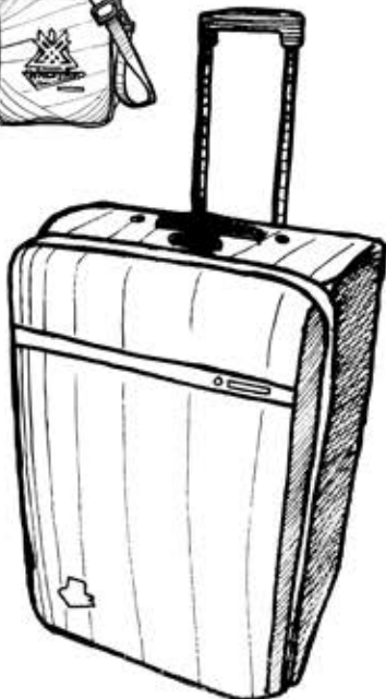
Luggage Bag x 1