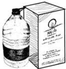
Zam Zam approx 5 litres